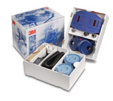
3M<sup>™</sup>Jupiter<sup>™</sup> Powered Air Turbo Unit

Standard 3M Jupiter turbo unit includes decontamination belt and clip, airflow indicator and calibration tube.